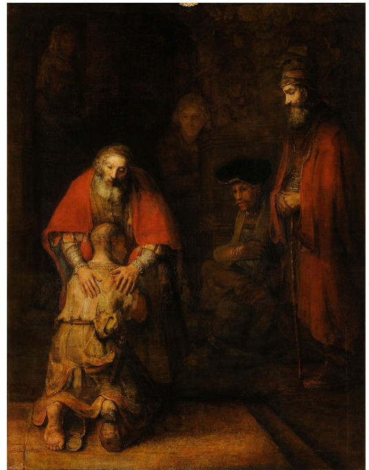
Rembrandt van Rijn, The Return of the Prodigal Son