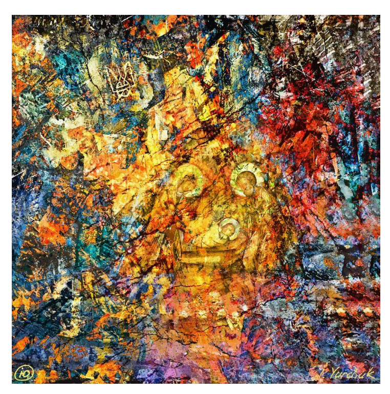
Irenaeus Yurchuk (Іриней Юрчук), Nativity (2023)