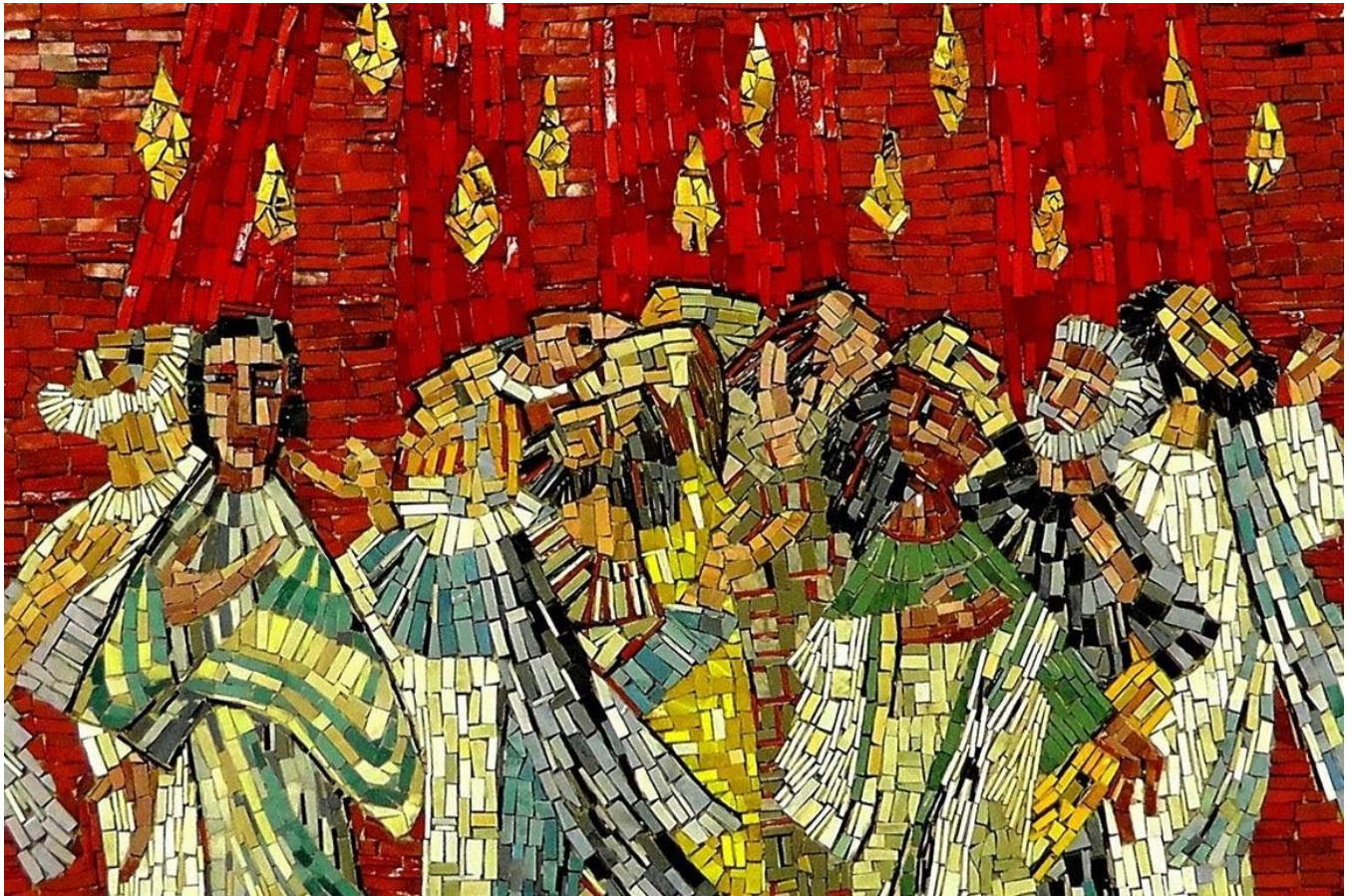
Pentecost Mosaic | Holger Schue